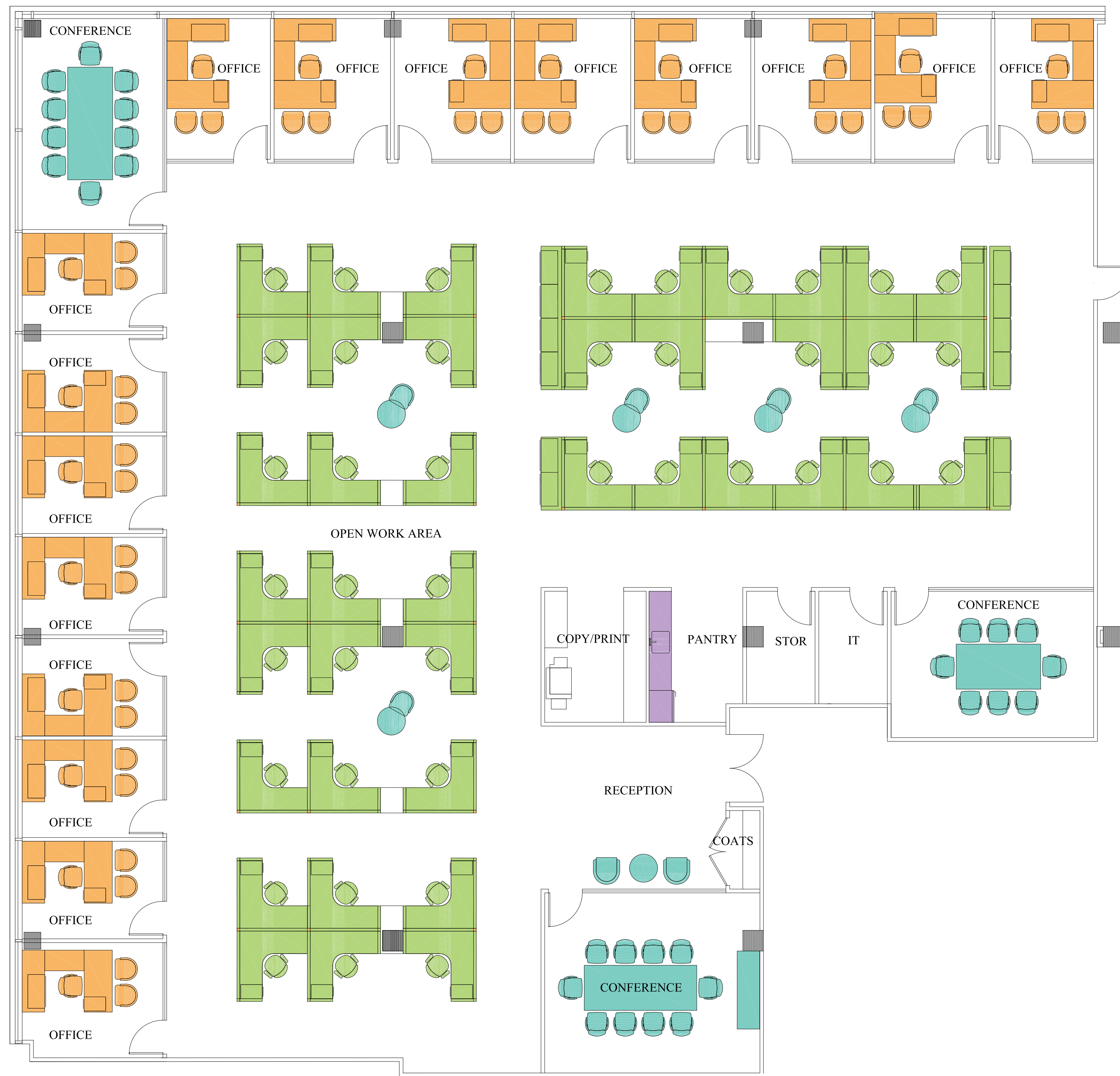
Proposed Tenant Layout